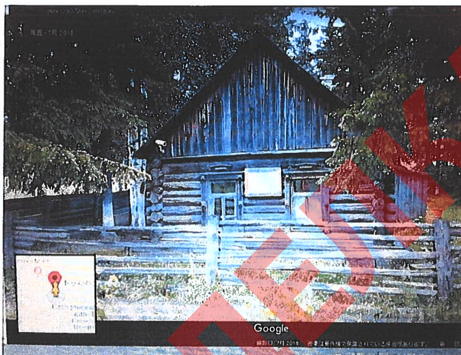
書類上住所地図 (Shadrina St., 20, Turukhansk, Krasnoyarsk Territory, 663230)